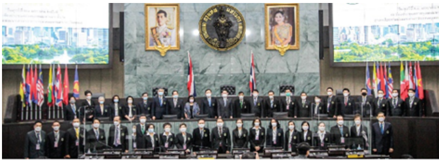
The Senior Executives Class on Metropolitan Development

The Office of the President is responsible for human resources management, general administration, finance and treasury, budgeting and procurement, policy and planning, information technology, international relations, legal affairs, monitoring and evaluation, quality assurance, and the preparation of the University's annual reports. It also supports and promotes the implementation of the University's various missions in the areas of academics, research, academic services to society, and student affairs, as well as carrying out any other duties as assigned by the University Council or the University President. The Office of the University President offers 3 short-term executive training programs: