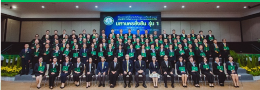
The Sustainable Integrated Metropolitan Development (SIMD)