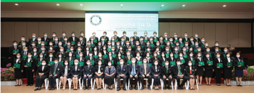
The Senior Executives Development Program for Urban Leadership Development